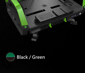
Black / Green