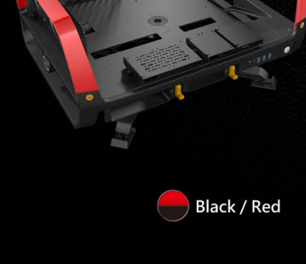
Black / Red

You can choose a variety of colors to create the ultimate themed battlestation.