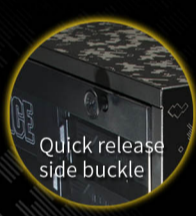
Quick release side buckle