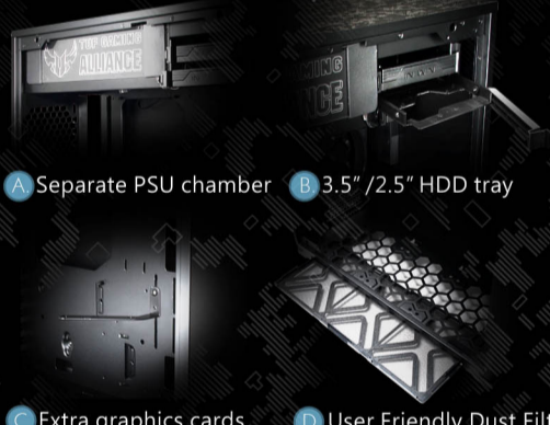
A Separate PSU chamber B 3.5" / 2.5" HDD tray C Extra graphics cards support holder D User Friendly Dust Filter