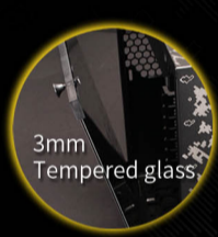
3mm Tempered glass